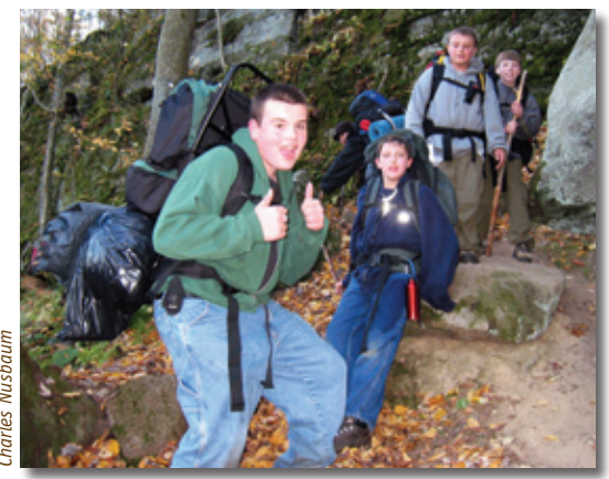
Ohio Scouts at Minister Creek.

Boys entering the Boy Scouts will complete a few basic requirements of a new Scout, including agreeing to live by the Scout Oath and Law. In this oath, he commits to "help other people at all times." His rank will be Tenderfoot, where the first requirement is to spend a night on a campout, including pitching a tent and cooking a meal. They are also required to explain the rules of safe hiking. The Buckeye