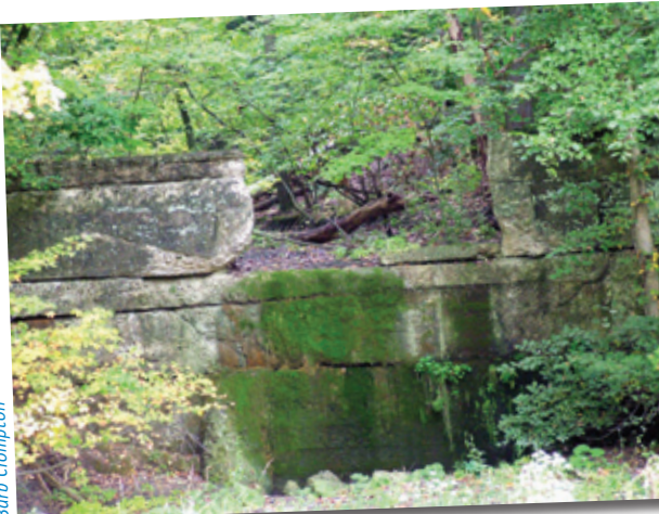
A lock along the Buckeye Trail in the Cuyahoga Valley.

It never dawned on me that it was being KEPT filled! I'd been on the Towpath just a few times, but hadn't taken the time to stop and read about the historic importance of the canal. Learning about the early history of this area I felt pride for the tremendously hard work these people did using their bare hands and sheer determination as tools to achieve their goals, the remains of