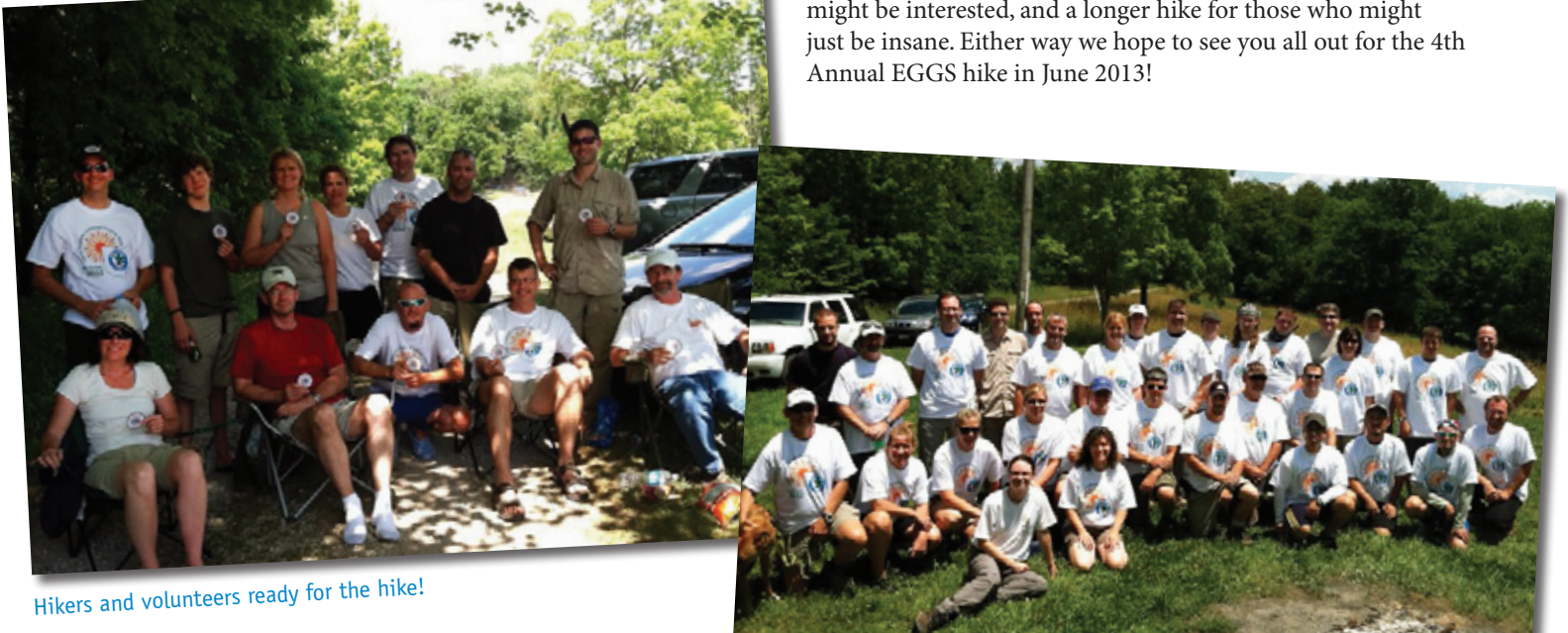
A few of the proud finishers showing off their 2012 EGGS patches.

Next year we plan on adding a shorter hike for those who might be interested, and a longer hike for those who might