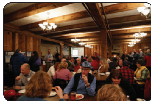
Attendees at the Membership Drive.