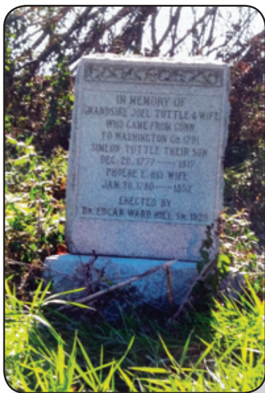
Monument honoring first settler in Washington County.