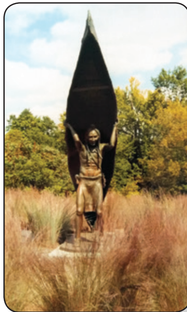
Monument at start of Portage Path from Cuyahoga River to Tuscarawas River.