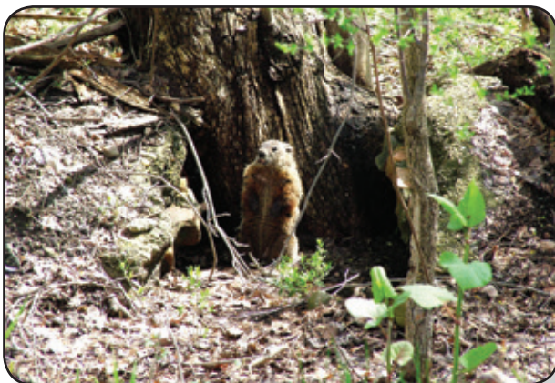
The woodchuck near the trail.

Heading ever uphill, we passed historic Glendale Cemetery, an old Krispy Kremes store (my father's favorite), and the Akron City Zoo. I finally noticed the distinctive arrowhead signs indicating that we'd been on the Portage Path Trails as well as the BT. As we turned onto gently curving Trail Street, we felt the breadth and depth of spring when we caught the first glimpse of a row of beautiful flowering trees dotted along the banks of Summit Lake. The lake was so high that its water and the geese bobbing in it lapped up close to the trail. The trail turned away from the lake down onto a unique, abandoned-looking street, and after a few moments we ran into a barge parked on dry ground that looked more like someone's backyard deck! But that was the end of the most scenic part; suddenly we were thrust out onto busy streets and into furious traffic, crossing bridges and getting sand blasted by the vehicles speeding through there. I was just utterly exhausted! I kept trying to find out how much longer we had left to go, but Danny wouldn't let me look. I knew he thought he'd only be doing one trip with me, but I think I'm going to ask him to tag along again! Thank you, Danny Sweeney!