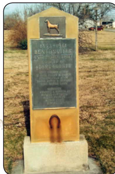
Bentonville monument for Anti-Horse Thief Society.