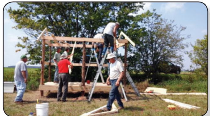
Trail crew members building the shelter during the Delphos Work Party