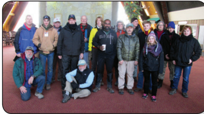
A band of hearty souls before the start of their hike.