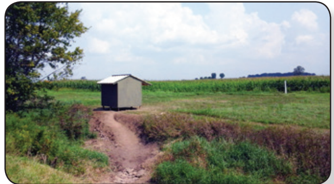
Newly completed shelter at Lock 18 south of Delphos, now allowing hikers an additional place to camp along the trail.

the trail, we still have areas where major gaps exist between campsites. Two such examples are in southwest Ohio in Brown and Adams County and on the Wilderness Loop in southeast Ohio. If you know of anyone that can help us in those locations or know of landowners who may be interested in helping in the project, please feel free to contact the Trail Preservation Committee at preservation@buckeyetrail.org .