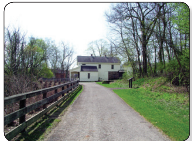
Mustill Store, now a visitor's center.