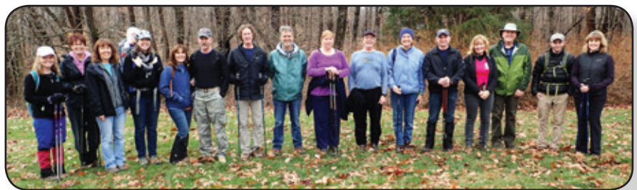
Some of the Caesar's Creek hikers.