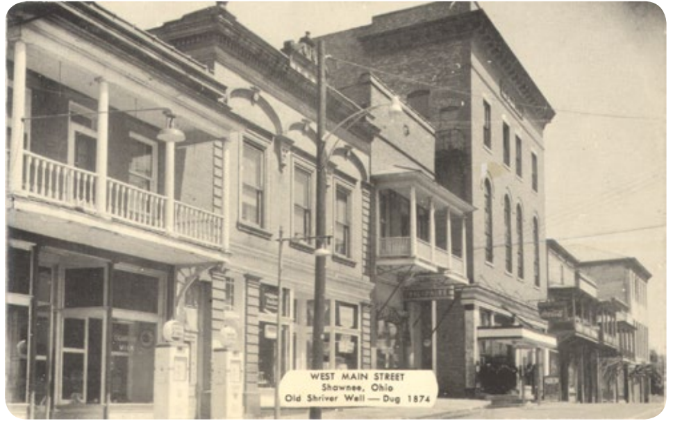
Shawnee, OH - West Main Street

Together these efforts won't just document historic places and events along the BT, we will attempt to foster an understanding of how our shared natural history and cultural heritage along the BT impact