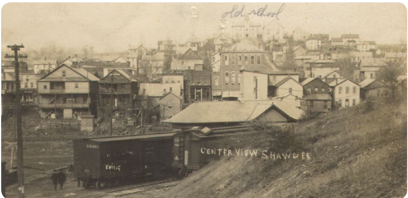
Shawnee, OH - railroad track and center view of town 1909