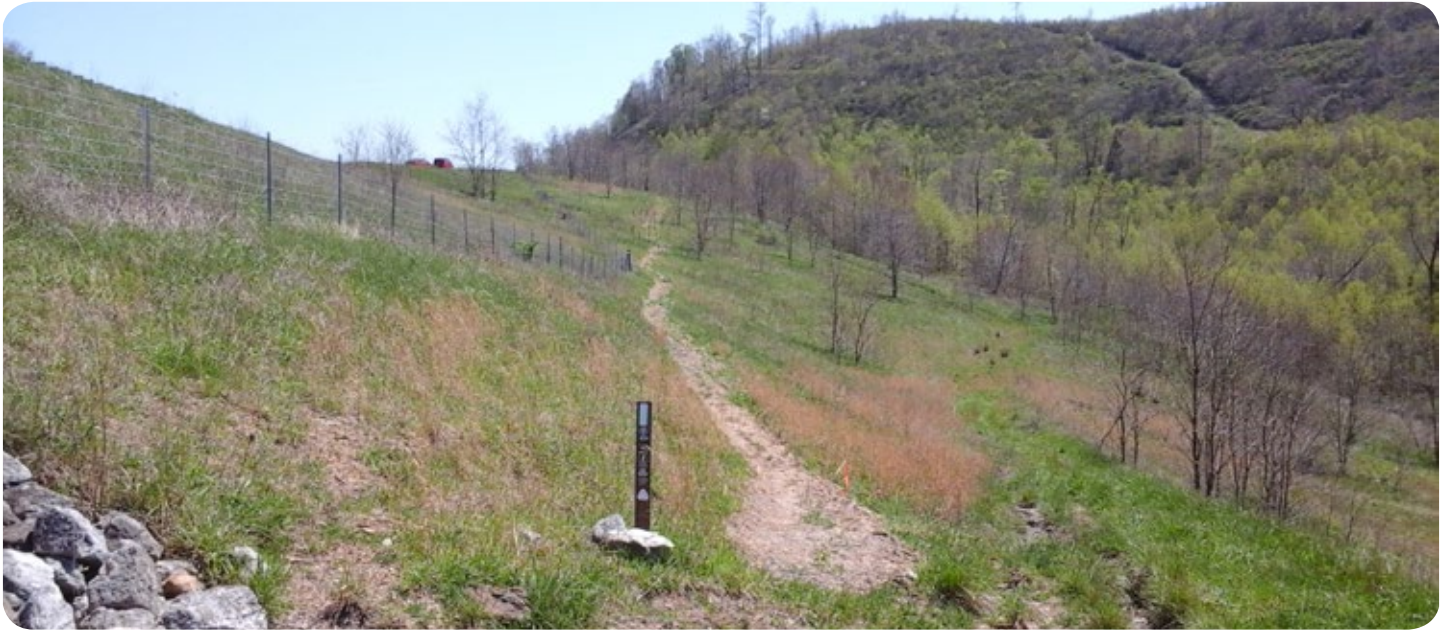
New trail built by the trail crew to reroute the trail near us 35 in the Scioto Trail Section

The new year has begun for trail building and maintenance along the trail and the Buckeye Trail Crew and local chapters are as busy as always. Here are some highlights of the first three work parties of the year!