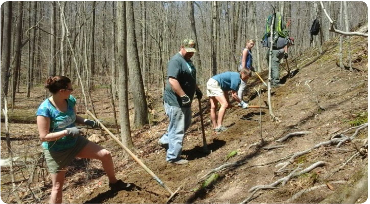
Cutting the bench for new trail through Crowell-Hilaka