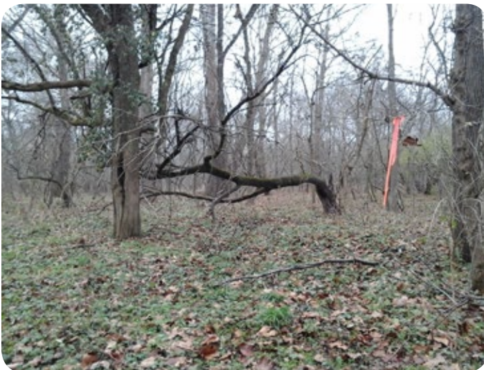
New campsite location along the Little Miami River in Loveland