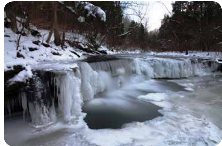
Horseshoe Falls, Caesar Creek State Park