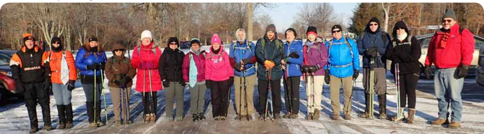
A group of hikers at Caesar Creek State Park